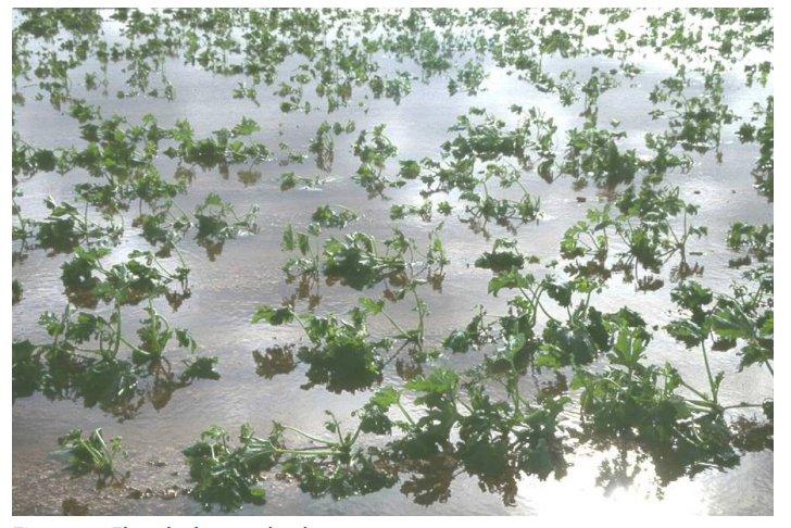
Figure 2. Flooded squash plants.