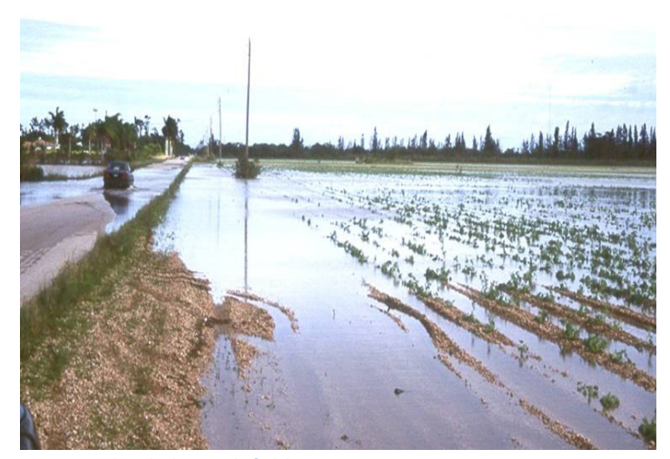
Figure 1. Flooded squash field.