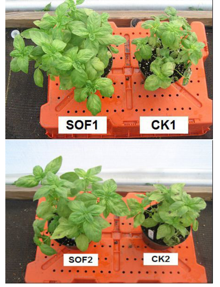
Figure 3. Growth differences in flooded Italian basil with and without oxygen fertilization. SOF = solid oxygen fertilizer. CK = control.