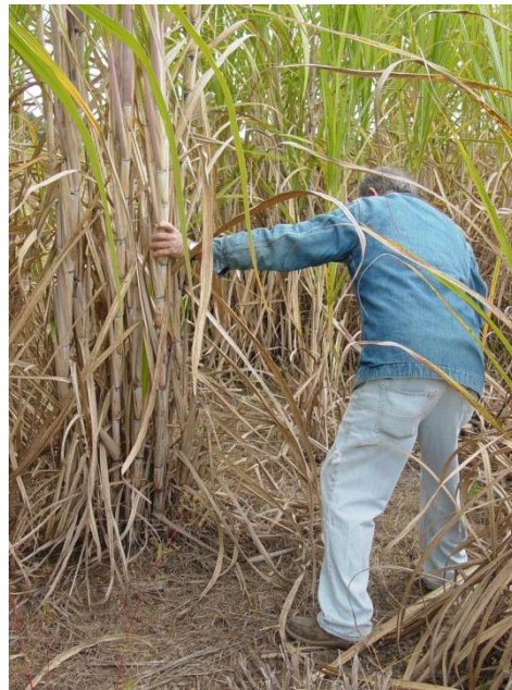
Cane Cutting at Field Day