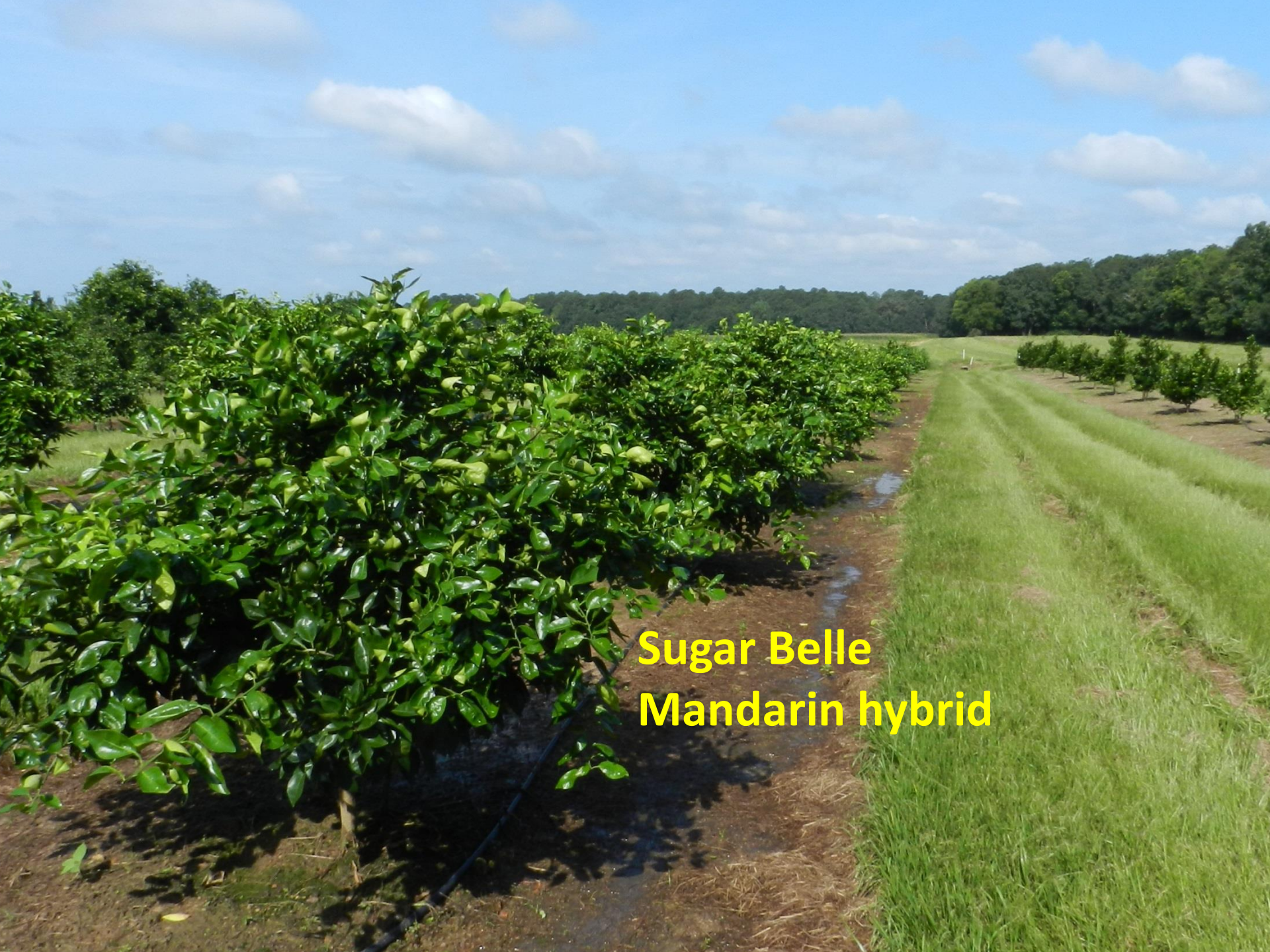
Sugar Belle Mandarin hybrid