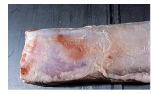
Rough handling of a live animal also can cause a bruise, like the one on this pork loin above, that must be trimmed away. Calm handling is better for livestock – and quality.