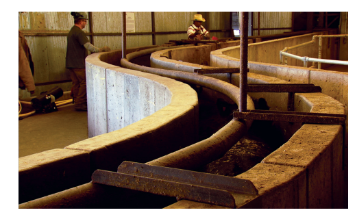
Livestock are curious animals that often will peek around a corner. They also like to return to where they started. Curved chutes like these, common in today's meat plants, prompt livestock to move forward easily with little pushing or prodding.

Lead sheep are removed prior to stunning through an "escape door" and repeat the process over and over — a behavior they are genetically "wired" to perform and one that creates the least stressful experience for the other sheep.