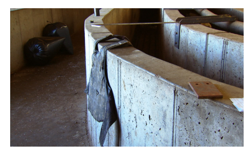
Plants strive to eliminate visual distractions that can frighten or distract livestock and hinder their movement, like a hose in a walkway, a dangling chain, or a coat on a rail, as depicted above.

One of the biggest obstacles to calm handling is distractions, which cause animals to balk and refuse to move. A white coat on a rail has high contrast and it attracts the animal's attention and may stop movement. A hose in a walkway can appear like a snake in the eyes or a steer. A sunspot or shadow also can be frightening. A hissing sound from a machine may sound threatening. And air blowing in livestock's faces