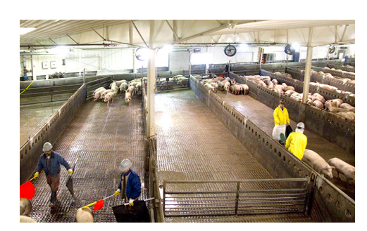
Pigs are held in meat plants in large groups pens, where they may rest and get a drink of water before they are processed. In this photo, you can see flags used to guide pigs.

some limited occasions, Dr. Grandin and other animal behaviorists have found that there are many low-stress substitutes, like a simple paddle with rattling beads inside. Often, the paddle need not touch the animal. The site and sound of a paddle held at the right point in the animal's vision will cause it to move forward. Other low stress driving tools include flags, whiffle bats with beads inside and even sticks with grocery bags attached to the end that make an audible crinkling sound.