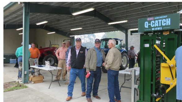
Equipment displays under pavilion outside the auditorium

175-200 cattle producers, extension faculty, and industry representatives from across the Tri-states region annually attend the Beef Conference. This type of format has been very successful for the past 34 years. Company representatives will make valuable contact with numerous beef producers from this region at one event.