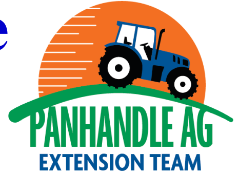
Exhibit at the 35 th annual Beef Conference Trade Show!

Sponsored by the UF/IFAS Panhandle Agriculture Extension Team