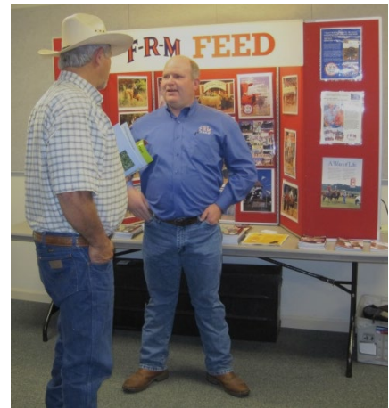
8 ft. Table top displays in auditorium

The agenda will have designated times for ranchers to visit with the Trade Show Exhibitors: 45 minutes during registration, 45 minutes in the middle of the program, and 1 hour immediately after lunch is served. In order to boost interaction between ranchers and exhibitors at the event, exhibitors will be briefly introduced just prior to the Trade Show break.