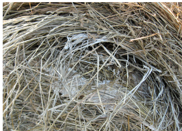
Figure 6. White mold, such as this patch on the flat side of a round bale, is a harmless yeast.

Molds that are green, blue, yellow, or red are indicative of a problem (Figure 7). A moldy patch that is red or red with a white edge is likely to be Monascus ruber , while yellow/green mold is Aspergillus fumigatus , and a patch of blue/green is Penicillium roqueforti . Baleage bales with any of these three mold colors present should not be fed to livestock as there is a risk of mycotoxins that may cause performance issues or, in some cases, animal death. The blue/green P. roqueforti is especially problematic because it produces several harmful mycotoxins.