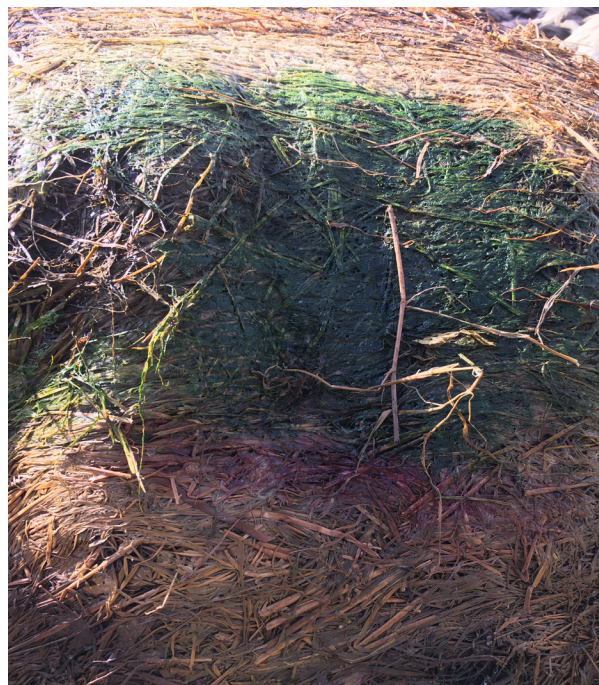
Figure 7. Molds that are green, blue, yellow, or red are indicative of a problem.