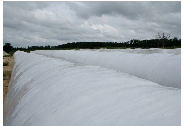
Figure 2. Uniform bales abut one another more evenly and lower the risk of compromising the plastic.

Whether the wrapper is an in-line or individual wrapper also determines how each bale is wrapped. An in-line wrapper system uses two to four rolls of polyethylene plastic simultaneously, while an individual wrapper usually uses a single roll. For an in-line system, the bales are loaded onto the wrapper (Figure 3; right) and a push bar hydraulically feeds the bale through the wrapper. As the bale moves through the chamber, two plastic rolls rotate around the bale, with approximately 10-20% overlap as the next bale is loaded. Wrapped bales will stay in the same location until the tube is opened for feeding. When wrapping bales individually (Figure 3; left),