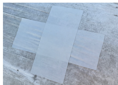
Figure 5. A good example of a well-chosen and maintained baleage storage site (left). It is important to select a baleage storage site that is free of items that might poke holes in the plastic and to maintain the integrity of the plastic during storage. Minimize plant growth around the wrapped bales, as this often attracts birds, mice, or other vermin that might damage the plastic. Repair any holes by applying two layers of silage tape in a cross (+) pattern to ensure adequate oxygen exclusion (right).