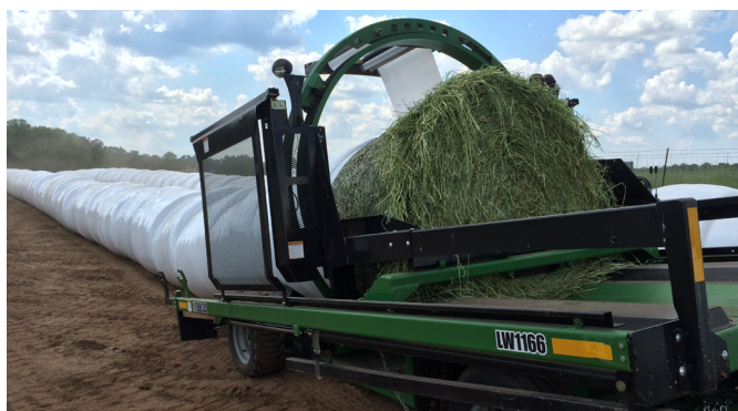
Figure 3. Examples of two basic categories of baleage wrappers: an individual bale wrapper on a trailer platform (left) and an in-line bale wrapper (right).