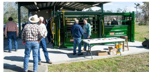
Equipment displays under pavilion outside auditorium