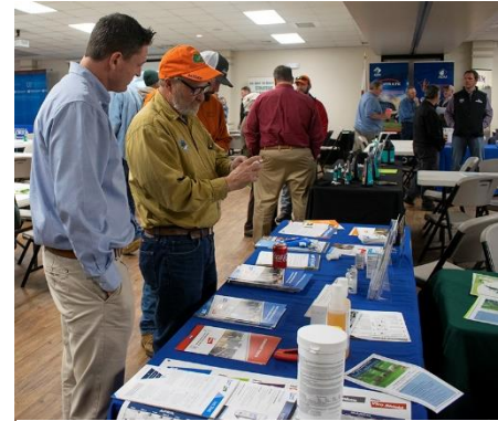
8' Tabletop displays in the auditorium

Door prizes are another tool many of our exhibitors use to introduce ranchers to their products. Each participant will be given a door prize ticket at registration, so if you would like to provide some product, bring it with you to the event. Door prize tickets will be drawn as soon as the last participant has been served lunch.