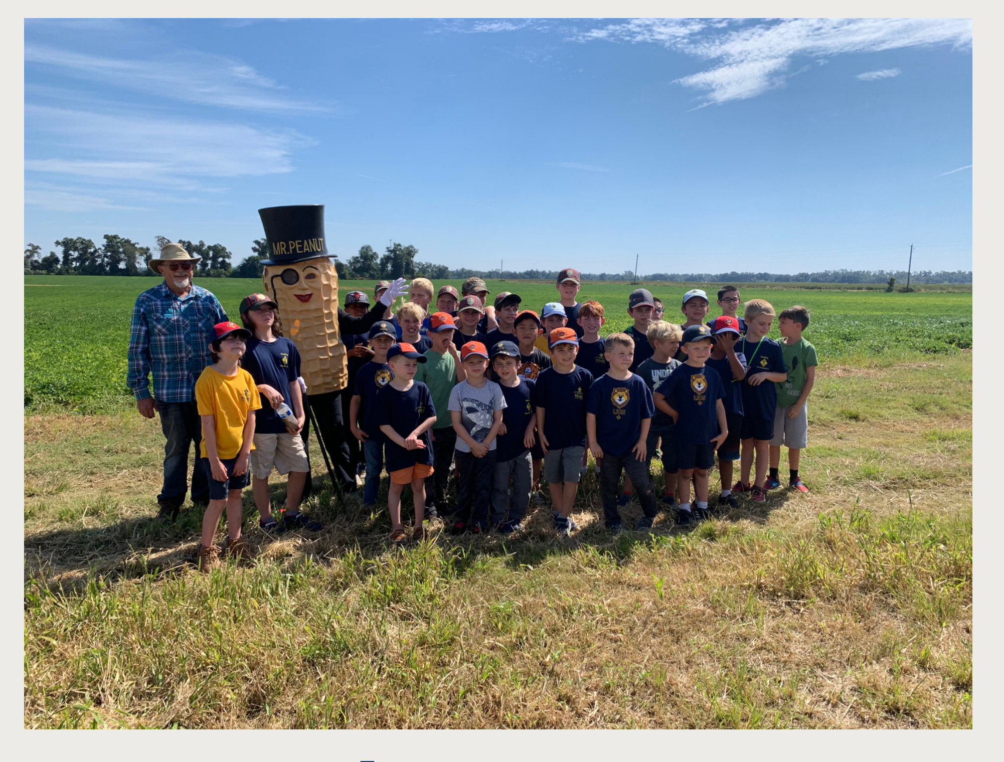
Cub Scouts Pac 40 October 8, 2022