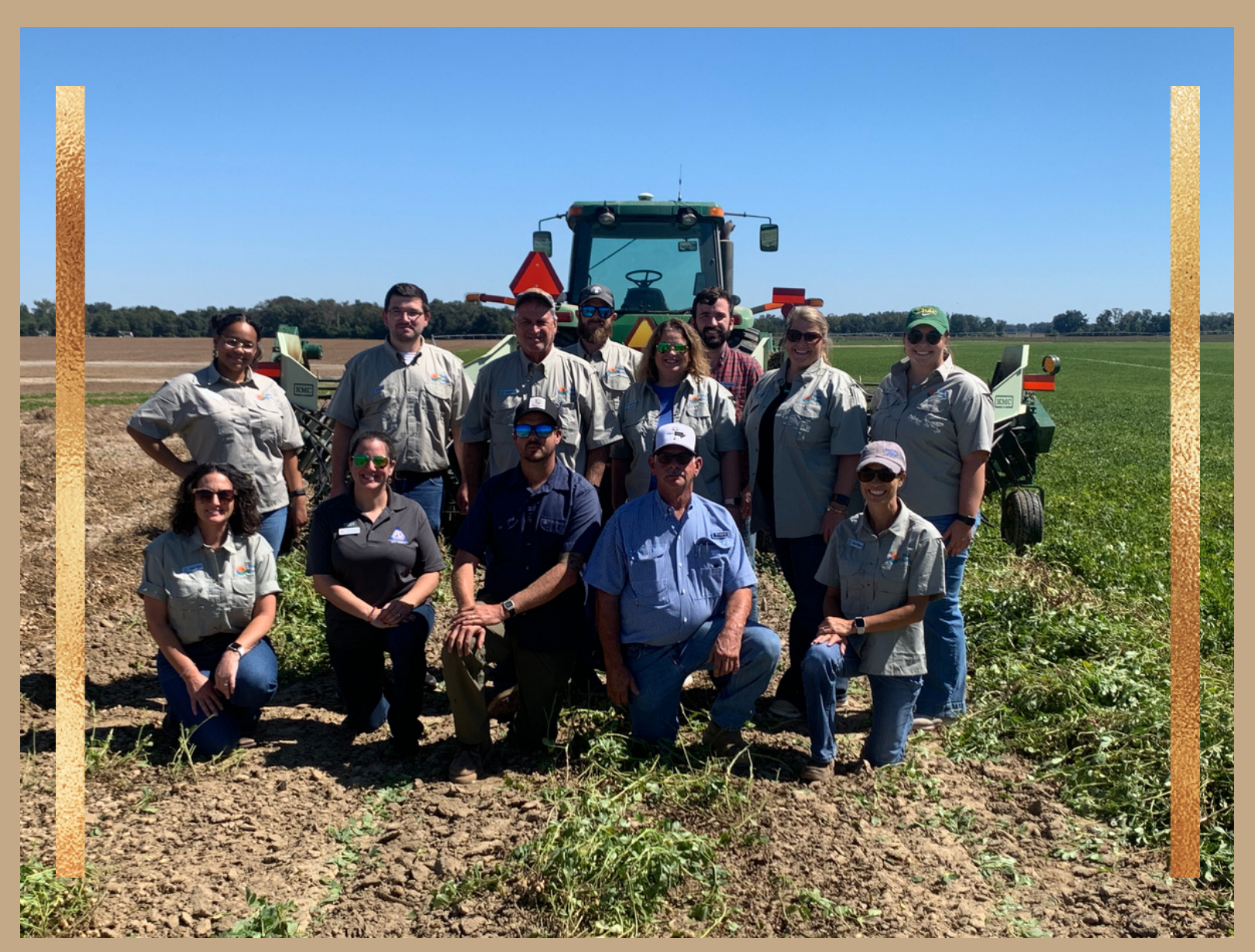
October 6, 2022