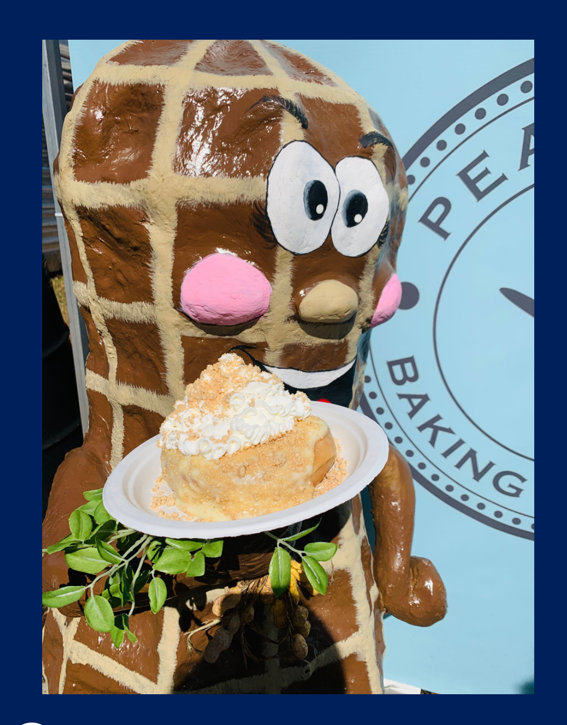
February 9-20, 2023 Tampa, FL