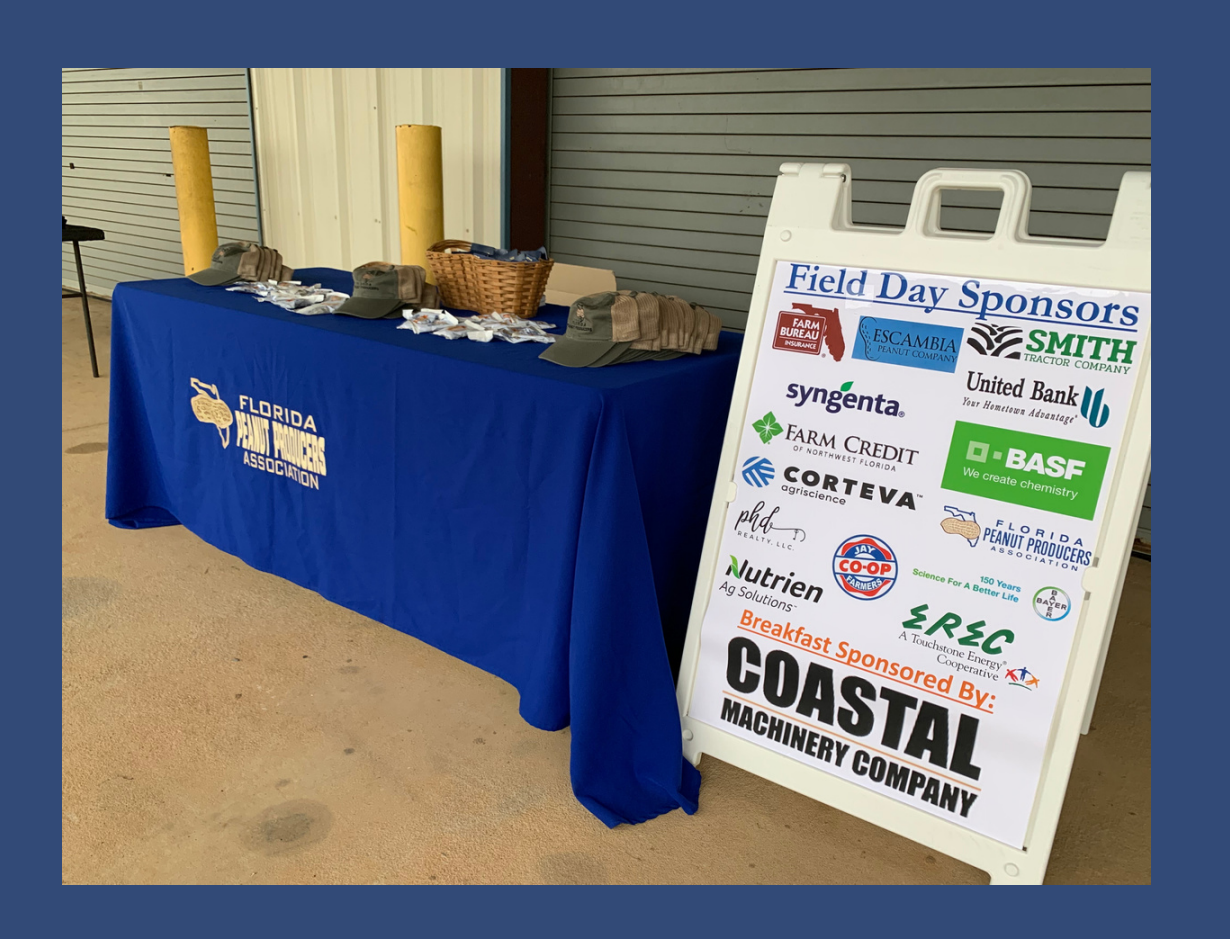
August 25, 2022 Jay, Fl