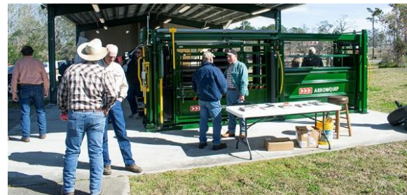
Equipment displays under pavilion outside auditorium