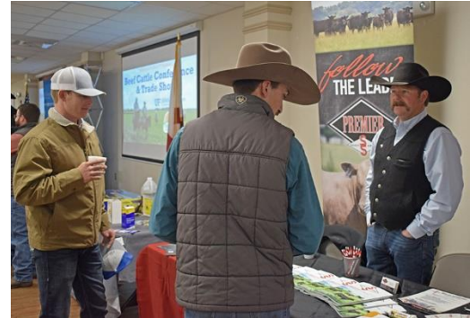
8 ft. Tabletop displays in auditorium

Door prizes are another tool many of our exhibitors use to introduce ranchers to their products. Each participant will be given a door prize ticket at registration, so if you would like to provide some product, bring it with you to the event. Door prize tickets will be drawn as soon as the last participant has been served lunch.