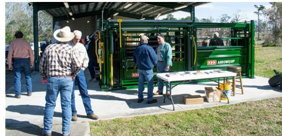
Equipment displays under pavilion outside auditorium

The Beef Cattle Conference is a non-profit, annual educational program provided by the Panhandle Ag Extension Team. The trade show exhibitor fees cover major expenses for the event: speaker travel, drinks and snacks, and a grilled steak lunch for everyone in attendance.