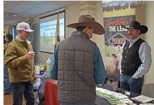
8 ft. Tabletop displays in auditorium

Door prizes are another tool many of our exhibitors use to introduce ranchers to their products. Each participant will be given a door prize ticket at registration, so if you would like to provide some product, bring it with you to the event. Door prize tickets will be drawn as soon as the last participant has been served lunch.