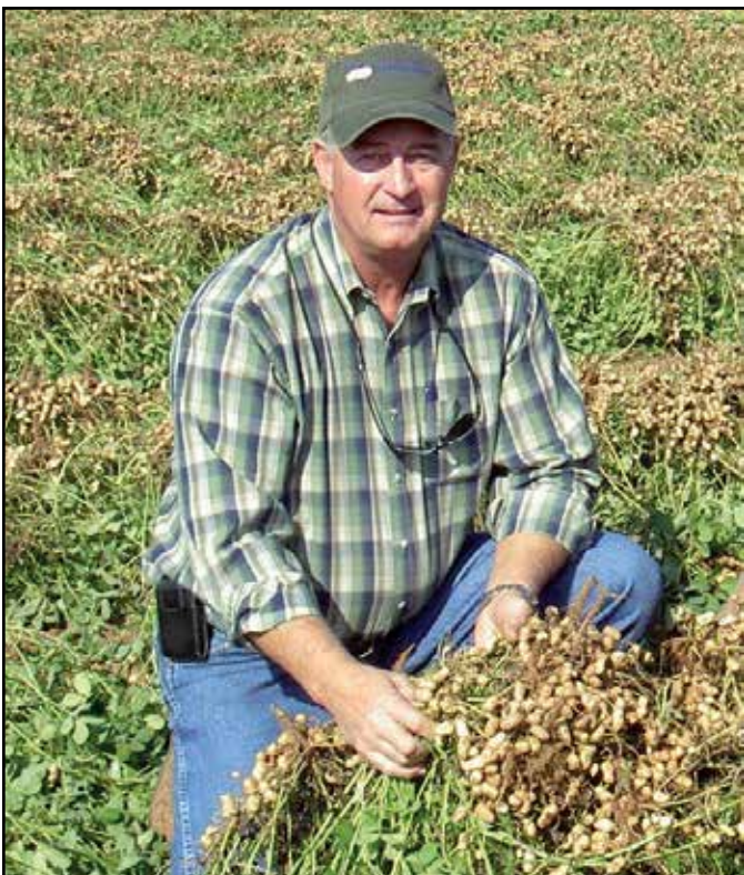
Northwest Florida Extension District